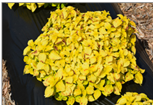
Terra Nova Pepperpot Coleus

Terra Nova Pepperpot Coleus is recommended for the following landscape applications;