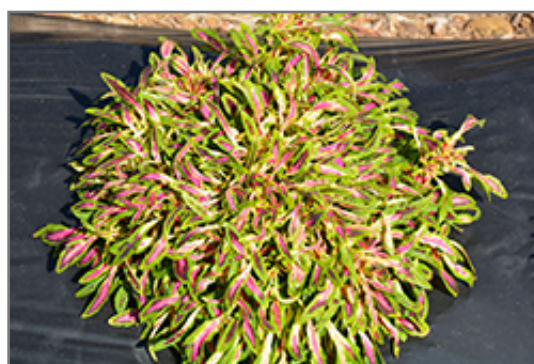
Fancy Feathers Pink Coleus