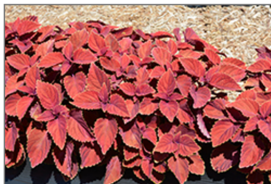
Color Clouds Valentine Coleus