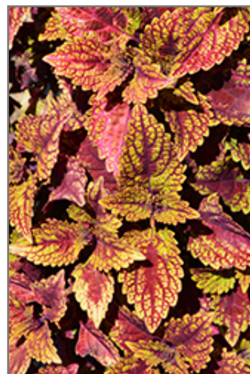
Color Clouds Spicy Coleus foliage

Color Clouds Spicy Coleus is recommended for the following landscape applications;