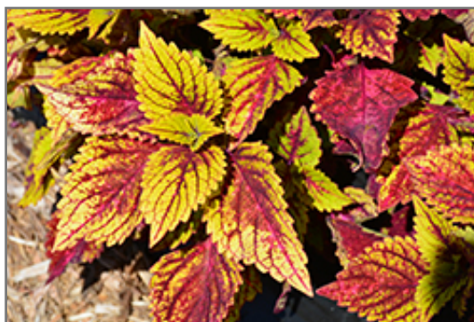
Color Clouds Hottie Coleus foliage