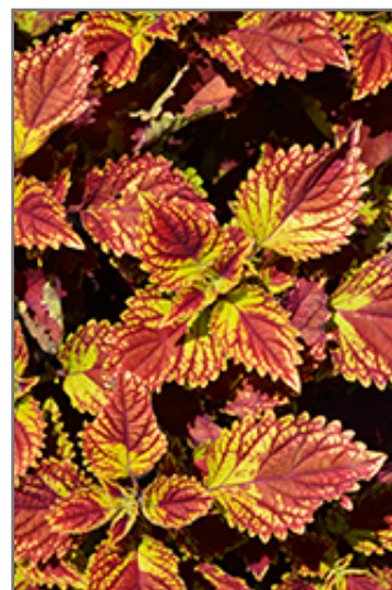
Color Clouds Be Mine Coleus foliage

Color Clouds Be Mine Coleus is recommended for the following landscape applications;