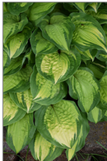
Island Breeze Hosta foliage

Island Breeze Hosta is recommended for the following landscape applications;