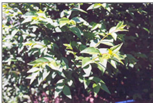
Common Privet foliage