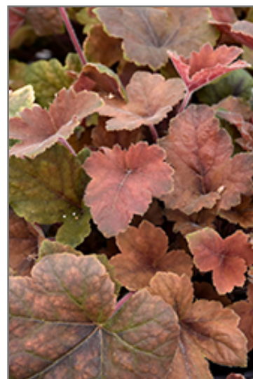
Pumpkin Spice Foamy Bells foliage

Pumpkin Spice Foamy Bells is recommended for the following landscape applications;