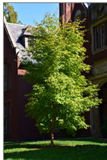
Three Flowered Maple

Three Flowered Maple will grow to be about 30 feet tall at maturity, with a spread of 30 feet. It has a low canopy with a typical clearance of 5 feet from the ground, and should not be planted underneath power lines. It grows at a slow rate, and under ideal conditions can be expected to live for 70 years or more.