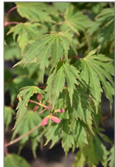
Northern Glow Maple foliage