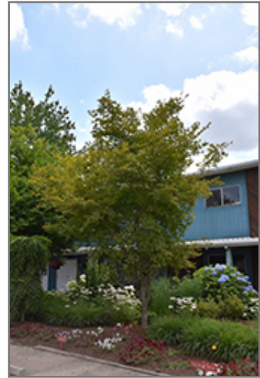
Northern Glow Maple

This plant is not reliably hardy in our region, and certain restrictions may apply; contact the store for more information.