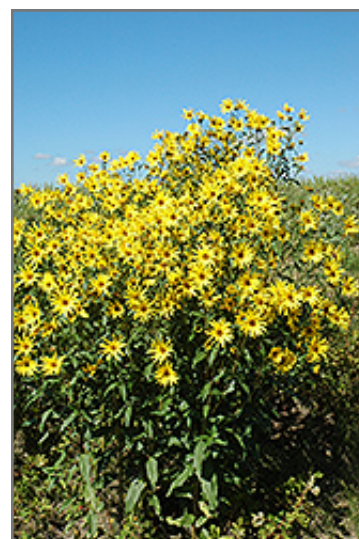
False Sunflower in bloom