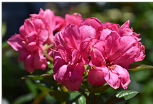
Encore Autumn Jewel Azalea flowers

This stunning, compact evergreen shrub is bathed in clusters of beautiful rose pink flowers, and will bloom all season; an excellent choice to mass in groupings; must have rich acidic soil; one of the most cold hardy of the series