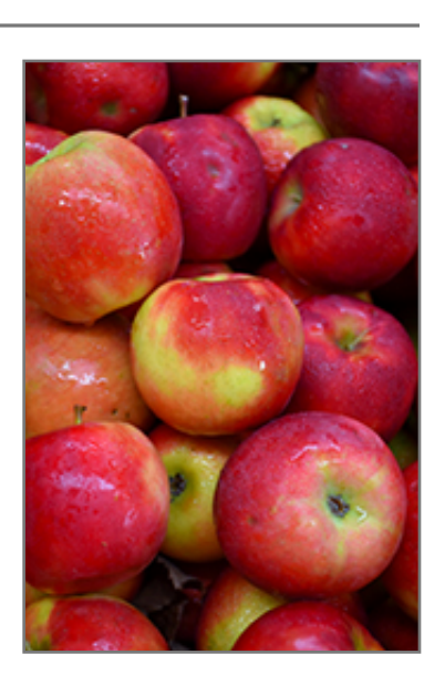
Crimson Crisp Apple fruit

Aside from its primary use as an edible, Crimson Crisp Apple is sutiable for the following landscape applications;