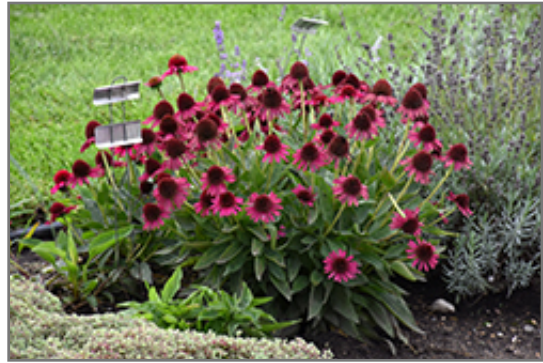
Delicious Candy Coneflower in bloom

Delicious Candy Coneflower will grow to be about 18 inches tall at maturity extending to 24 inches tall with the flowers, with a spread of 15 inches. It grows at a medium rate, and under ideal conditions can be expected to live for approximately 10 years. As an herbaceous perennial, this plant will usually die back to the crown each winter, and will regrow from the base each spring. Be careful not to disturb the crown in late winter when it may not be readily seen!