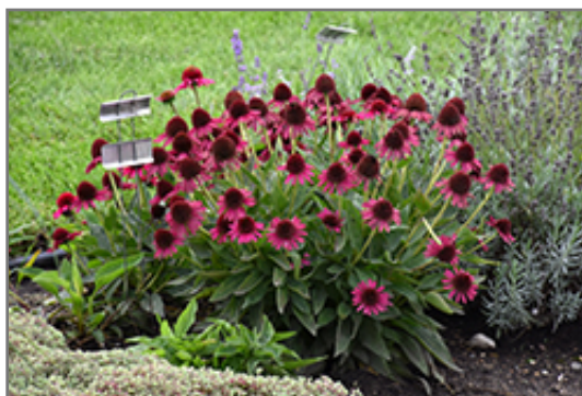
Delicious Candy Coneflower in bloom

Delicious Candy Coneflower will grow to be about 18 inches tall at maturity extending to 24 inches tall with the flowers, with a spread of 15 inches. It grows at a medium rate, and under ideal conditions can be expected to live for approximately 10 years. As an herbaceous perennial, this plant will usually die back to the crown each winter, and will regrow from the base each spring. Be careful not to disturb the crown in late winter when it may not be readily seen!