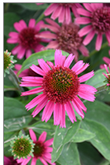
Delicious Candy Coneflower flowers

Delicious Candy Coneflower is recommended for the following landscape applications;