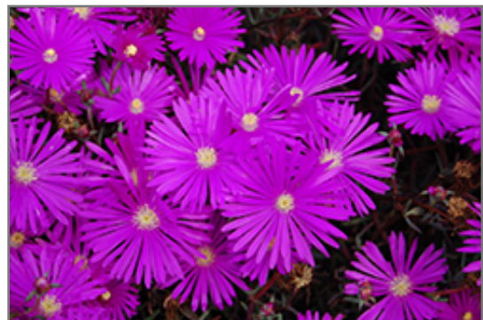
Jewel Of Desert Opal Ice Plant flowers