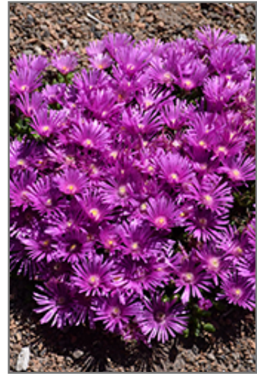
Jewel Of Desert Opal Ice Plant flowers

Jewel Of Desert Opal Ice Plant is recommended for the following landscape applications;