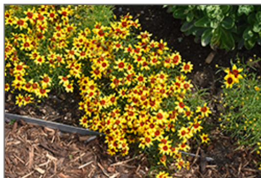
Sizzle And Spice Curry Up Tickseed in bloom