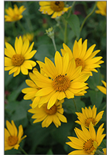
Hohlspiegel False Sunflower flowers

Hohlspiegel False Sunflower is recommended for the following landscape applications;