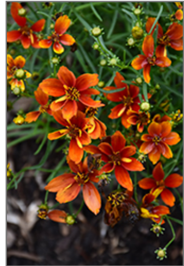
Sizzle And Spice Crazy Cayenne Tickseed flowers

Sizzle And Spice Crazy Cayenne Tickseed is recommended for the following landscape applications;