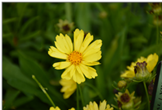
Leading Lady Sophia Tickseed flowers