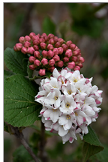
Spice Island Koreanspice Viburnum flowers

Spice Island Koreanspice Viburnum is recommended for the following landscape applications;