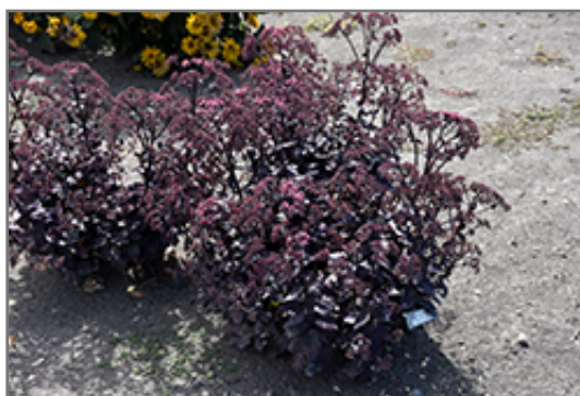
Cherry Truffle Stonecrop in bloom