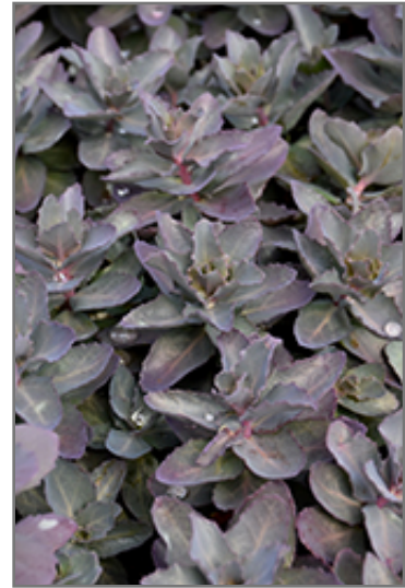
Cherry Truffle Stonecrop foliage

This plant is not reliably hardy in our region, and certain restrictions may apply; contact the store for more information.