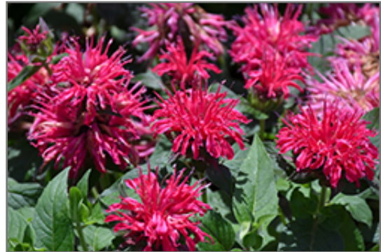
Balmy Rose Beebalm flowers

Balmy Rose Beebalm is recommended for the following landscape applications;