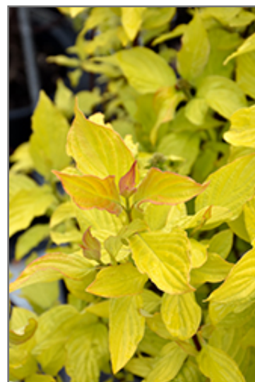
Neon Burst Dogwood foliage