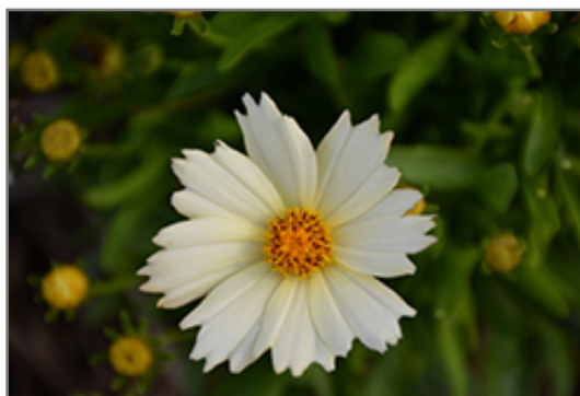
UpTick Cream Tickseed flowers