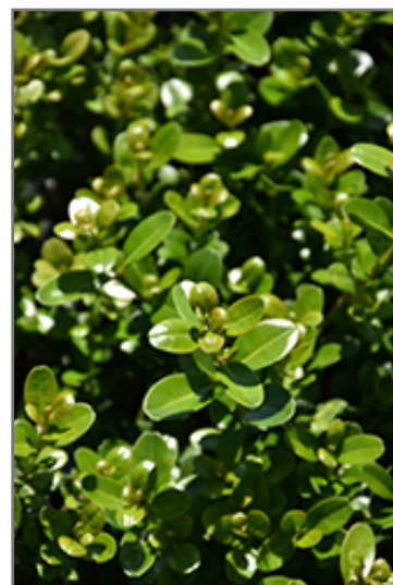
Sprinter Boxwood foliage