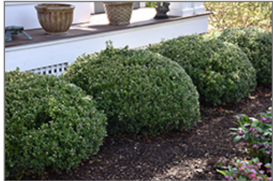
Sprinter Boxwood

Sprinter Boxwood will grow to be about 4 feet tall at maturity, with a spread of 4 feet. It tends to fill out right to the ground and therefore doesn't necessarily require facer plants in front. It grows at a fast rate, and under ideal conditions can be expected to live for approximately 30 years.