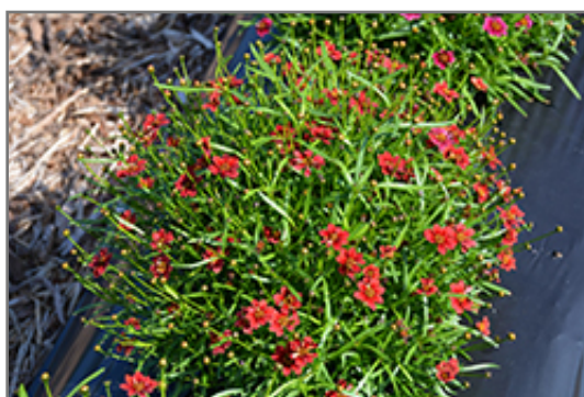
Twinklebells Red Tickseed in bloom