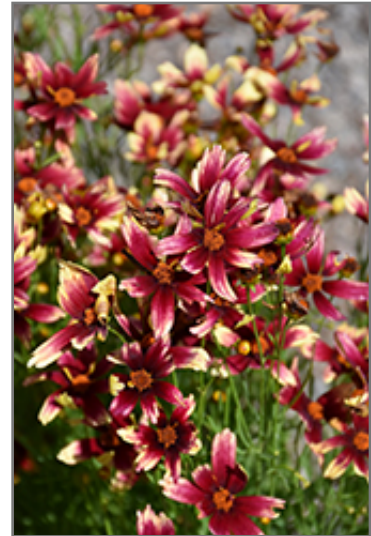
Satin & Lace Red Chiffon Tickseed flowers

This plant is not reliably hardy in our region, and certain restrictions may apply; contact the store for more information.