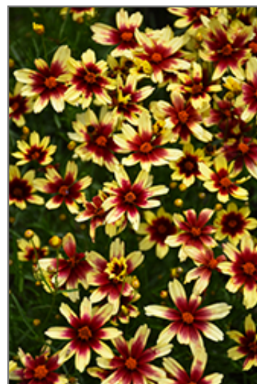
Satin & Lace Red Chiffon Tickseed flowers