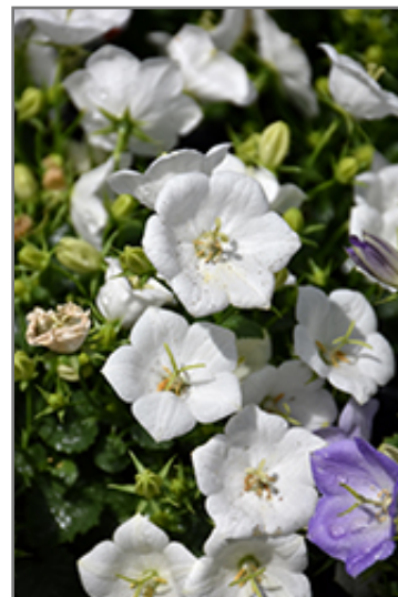
Rapido White Bellflower flowers