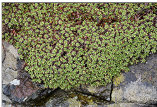
Cushion Bolax

Cushion Bolax is recommended for the following landscape applications;