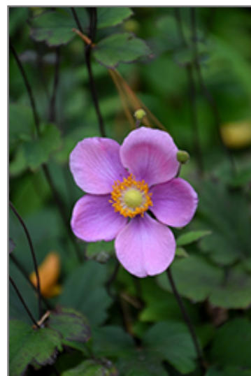
Lucky Charm Anemone flowers