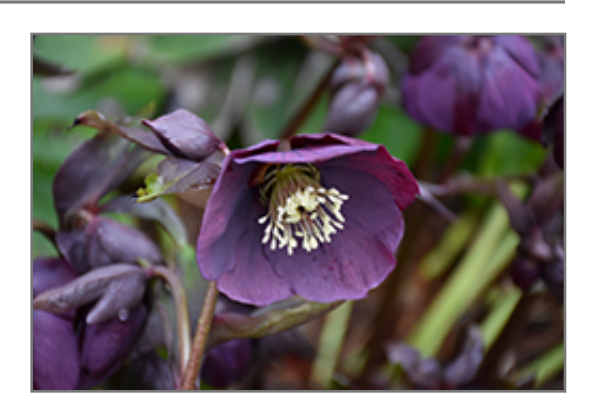
Winter Jewels Amethyst Glow Hellebore flowers

This attractive variety produces bushy mounds of thick evergreen leaves; flower stalks, held above the foliage bear showy, cup shaped, deep purple blooms with lighter purple edges; a great selection for shade gardens