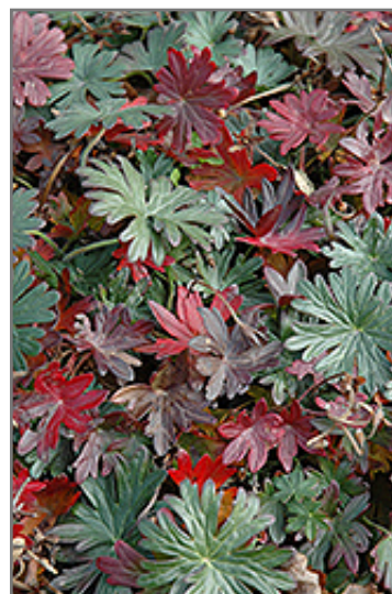
Bloody Cranesbill in fall

Bloody Cranesbill will grow to be about 12 inches tall at maturity, with a spread of 18 inches. When grown in masses or used as a bedding plant, individual plants should be spaced approximately 15 inches apart. Its foliage tends to remain dense right to the ground, not requiring facer plants in front. It grows at a medium rate, and under ideal conditions can be expected to live for approximately 10 years. As an herbaceous perennial, this plant will usually die back to the crown each winter, and will regrow from the base each spring. Be careful not to disturb the crown in late winter when it may not be readily seen!