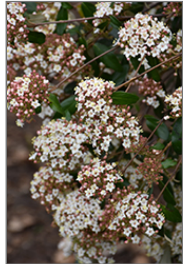
Service Viburnum flowers

Service Viburnum is recommended for the following landscape applications;