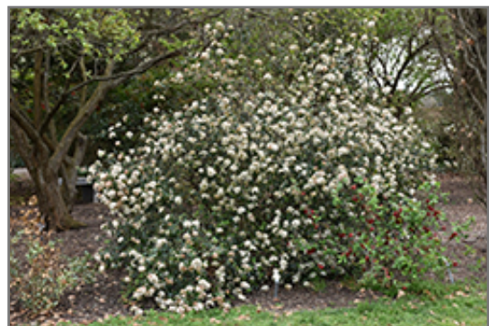
Service Viburnum in bloom