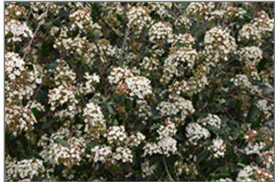
Service Viburnum flowers

Service Viburnum will grow to be about 6 feet tall at maturity, with a spread of 6 feet. It has a low canopy, and is suitable for planting under power lines. It grows at a medium rate, and under ideal conditions can be expected to live for 40 years or more. This variety requires a different selection of the same species growing nearby in order to set fruit.