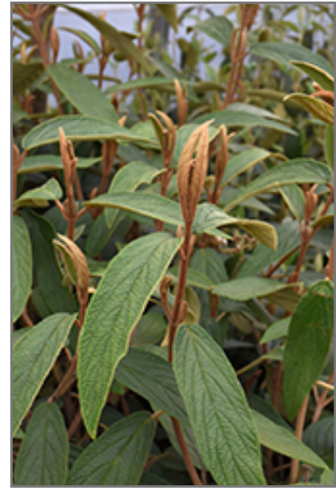
Leatherleaf Viburnum foliage

This plant is not reliably hardy in our region, and certain restrictions may apply; contact the store for more information.