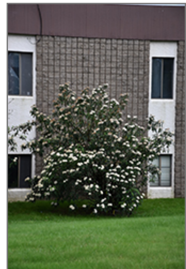
Leatherleaf Viburnum in bloom