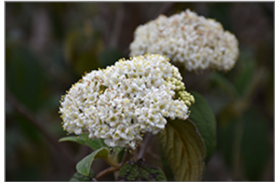
Leatherleaf Viburnum flowers

Leatherleaf Viburnum is recommended for the following landscape applications;