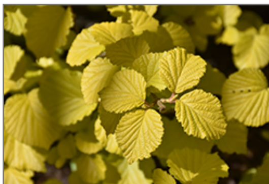
Akira's Sun Viburnum foliage

Akira's Sun Viburnum is recommended for the following landscape applications;