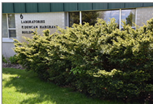
Morden Japanese Yew