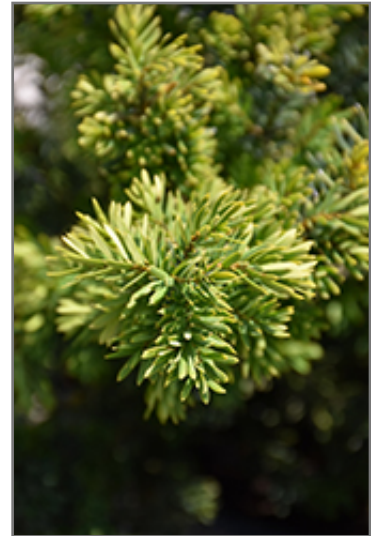
Morden Japanese Yew foliage

This plant is not reliably hardy in our region, and certain restrictions may apply; contact the store for more information.