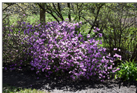
Compact Korean Azalea in bloom