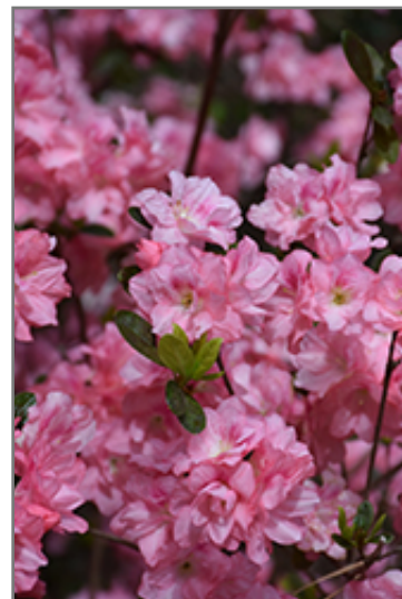
Sweetheart Supreme Azalea flowers