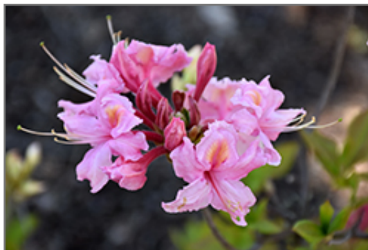
Strawberry Sundae Azalea flowers

Strawberry Sundae Azalea will grow to be about 5 feet tall at maturity, with a spread of 4 feet. It tends to be a little leggy, with a typical clearance of 1 foot from the ground, and is suitable for planting under power lines. It grows at a slow rate, and under ideal conditions can be expected to live for 40 years or more.