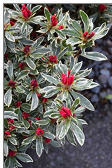
Silver Sword Azalea foliage