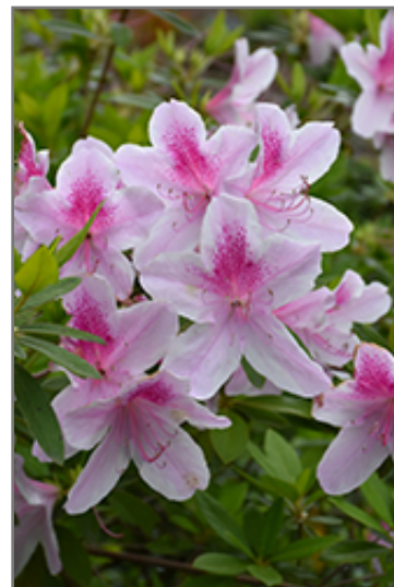
George Lindley Taber Azalea flowers