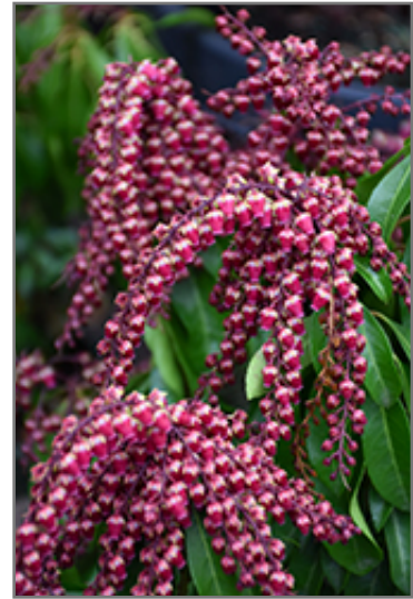
Gay Goblin Japanese Pieris flowers

A truly ornamental broadleaf evergreen shrub, prized for its delicate and showy chains of bright red bell-shaped flowers and bronze emerging foliage, dense and upright; performs best in moist, organic and acidic soils