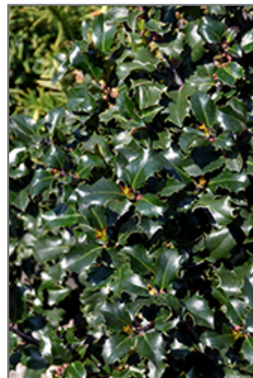
Blue Angel Meserve Holly foliage