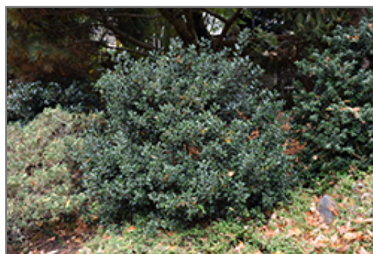
Blue Angel Meserve Holly