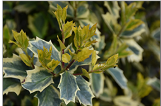
Solar Flare Holly foliage

An exciting ornamental plant with an upright, bushy habit; bold dark green, glossy leaves with striking yellow edges; this female clone sets berries later in the season; a showy addition to shrub borders