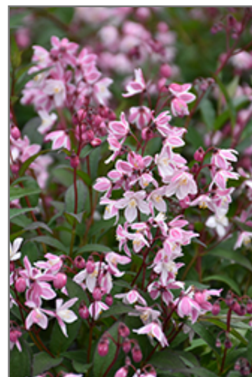
Yuki Cherry Blossom Deutzia flowers