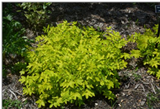
Golden Queen Of The Meadow