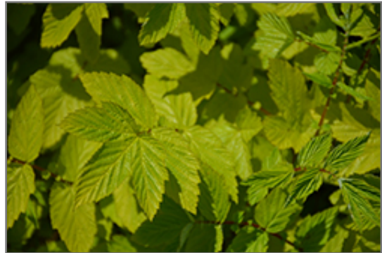
Golden Queen Of The Meadow foliage

This plant does best in partial shade to shade. It is quite adaptable, preferring to grow in average to wet conditions, and will even tolerate some standing water. It is not particular as to soil pH, but grows best in rich soils. It is somewhat tolerant of urban pollution. Consider applying a thick mulch around the root zone over the growing season to conserve soil moisture. This is a selected variety of a species not originally from North America. It can be propagated by division; however, as a cultivated variety, be aware that it may be subject to certain restrictions or prohibitions on propagation.