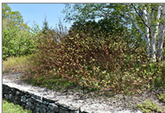
Bailey's Red Twig Dogwood in spring