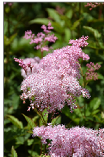
Queen Of The Prairie flowers