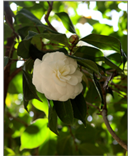
Masterpiece Camellia flowers